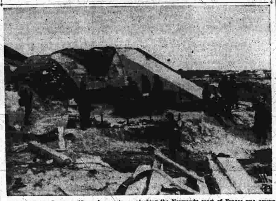
This massive German pillbox of concrete overlooking the Normandy coast of France was among the strongpoints in the enemy's first line of defense.